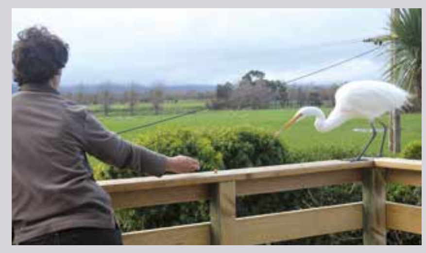
Goldie drops in for breakfast before heading off to the lake.

Initially it ate all the goldfish in their pond by the house so was appropriately named Goldie. Later it was even observed predating a small bird in a tree by the house.