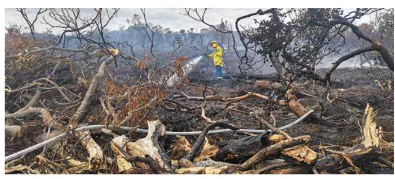
A firefighter douses hotspots at the Kaimaumau wetlands.

During the past summer and autumn, two devastating and costly wetland fires challenged firefighters who spent weeks trying to contain the widespread fires at both ends of the country.