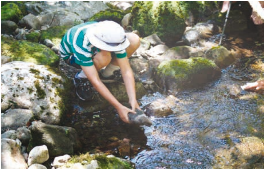
Into the wild: And another one goes in.