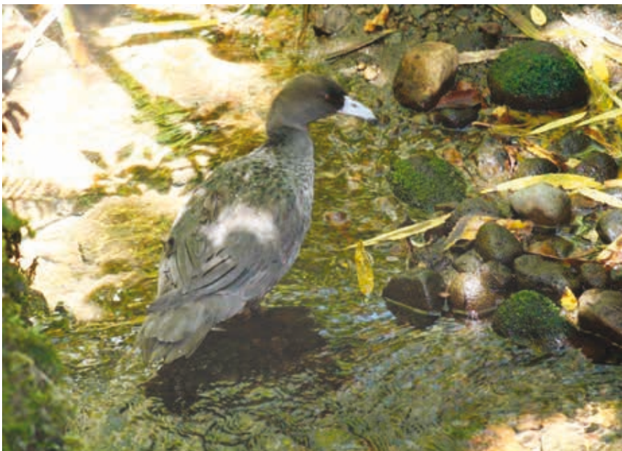
New home: A just released whio cautiously checks its new surroundings.

Whio were not having a good breeding season when this report was filed.