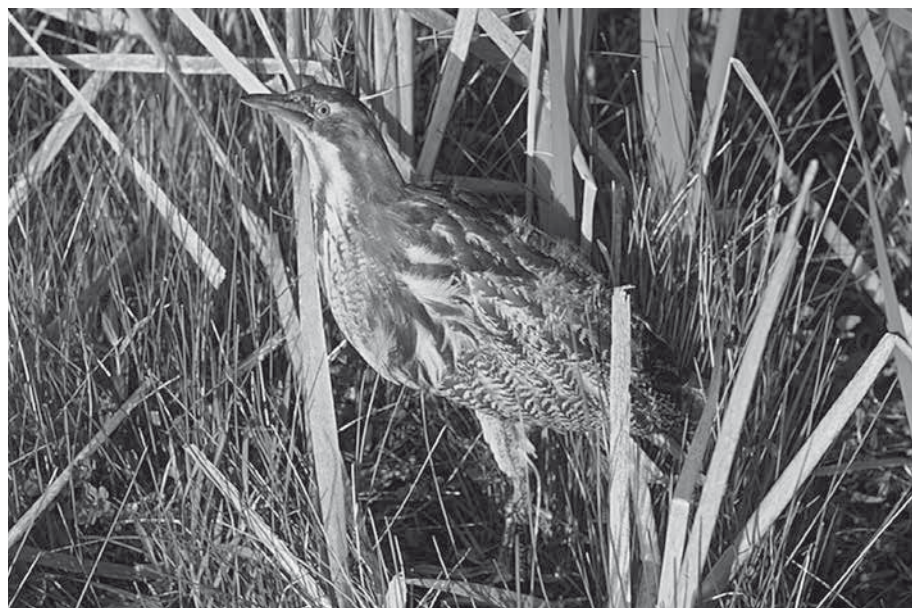
Bitten: in cover.

In the Kaipara, Franklin and Rodney district