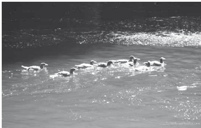
Fast water: And loving it

Eight happy whio tasting freedom on the Maunganui-a-te-ao river were among several released in March from the breeding programme.