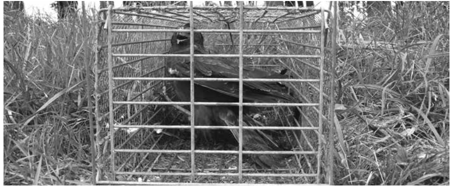
Caught: An Australian Harrier in a trap.

This partial protection was ‘inspired’ by the