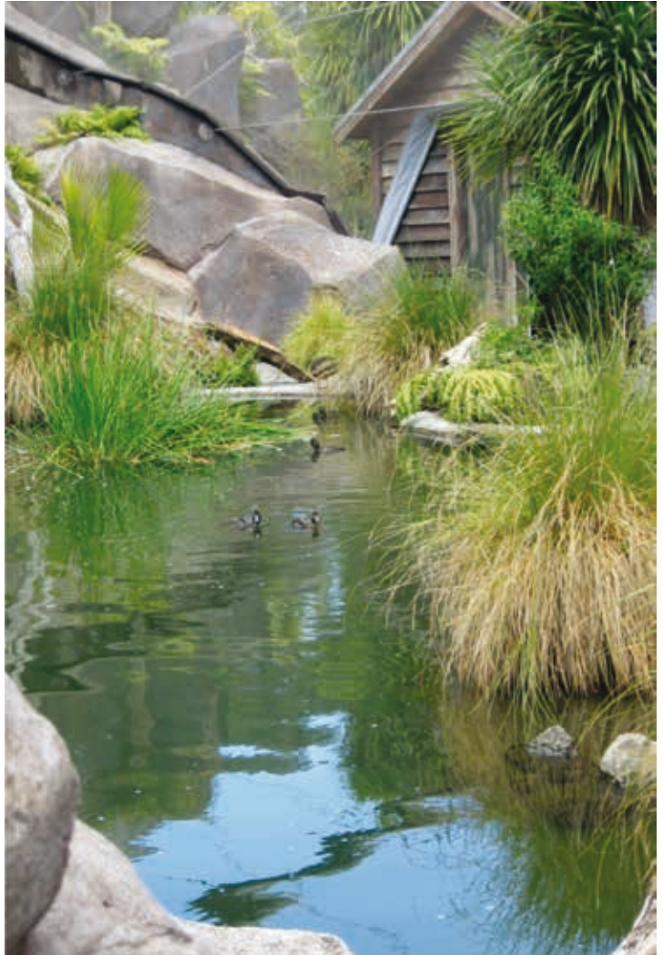
Wetland exhibit: Ngā Repo at Te Wao Nui, complete with pateke (brown teal) and papango (NZ scaup).

Fish & Game provided stickers for the kids and educational material to encourage farmers to restore wetlands and protect game bird habitat. The 2013 Game Bird Habitat stamp this year features the endangered New Zealand bittern ( Botaurus poiciloptilus ). Bittern are not allowed to be hunted but they share similar wetland habitat to game bird species. Fish & Game use the proceeds from the stamps programme and other activities to fund wetland habitat protection.