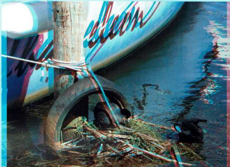
Australasian coot in Taupo