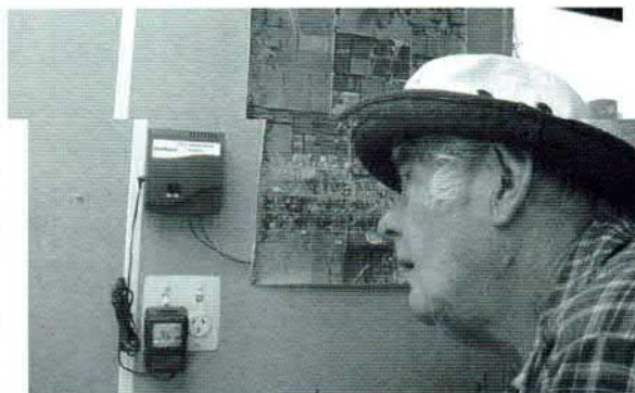
This is the plug-in site

When wearing the collar the dog gets a warning beep a little over a metre from the wire and any closer gets a belt. Flags are provided to put at the warning distance for training, which is supposed to be quite extensive but I found Jess learned very quickly. For two days you have the dog on a lead without the collar and correct it when it gets to the flags. On the third day you take your dog wearing the collar to the flags and let it hear the beep and then get a belt. The next day I couldn't get Jess anywhere near the flags so