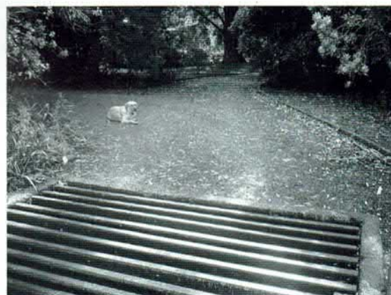
No way is Jess going past those white flags either side of the cattlestop!!

It's now six weeks since she's been off the section without me and interestingly she seems to know when she's wearing the collar.