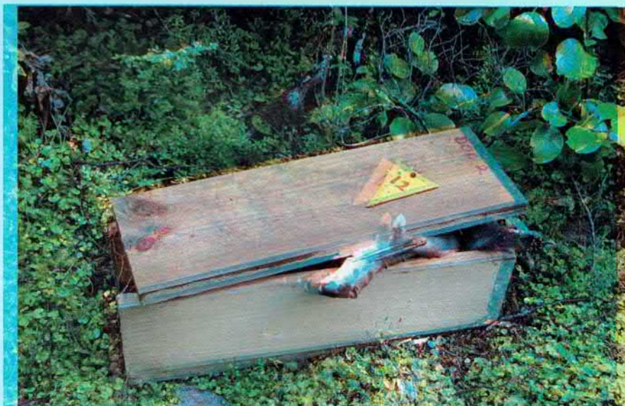
Stoat in DOC trap