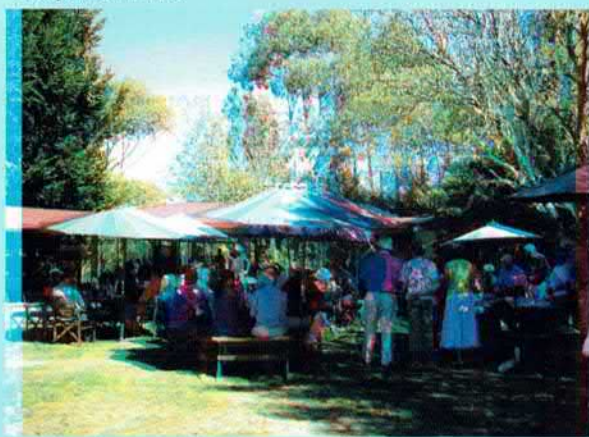
A flavour of the day in the sun at Gladstone