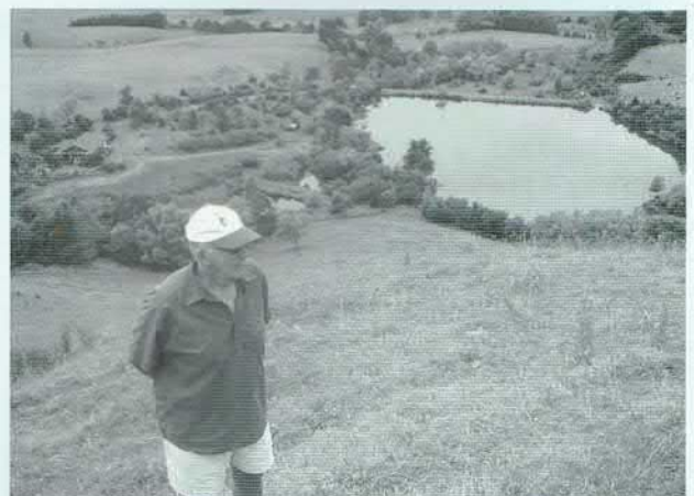
The view from the top