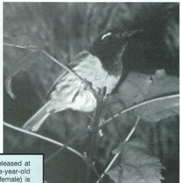
The stitchbird, or hihi

Hihi nest in tree cavities (which may make them more vulnerable to predators) and have an unusual mating system in which females may breed with a single male or several. They are also the only bird known to sometimes mate face to face!