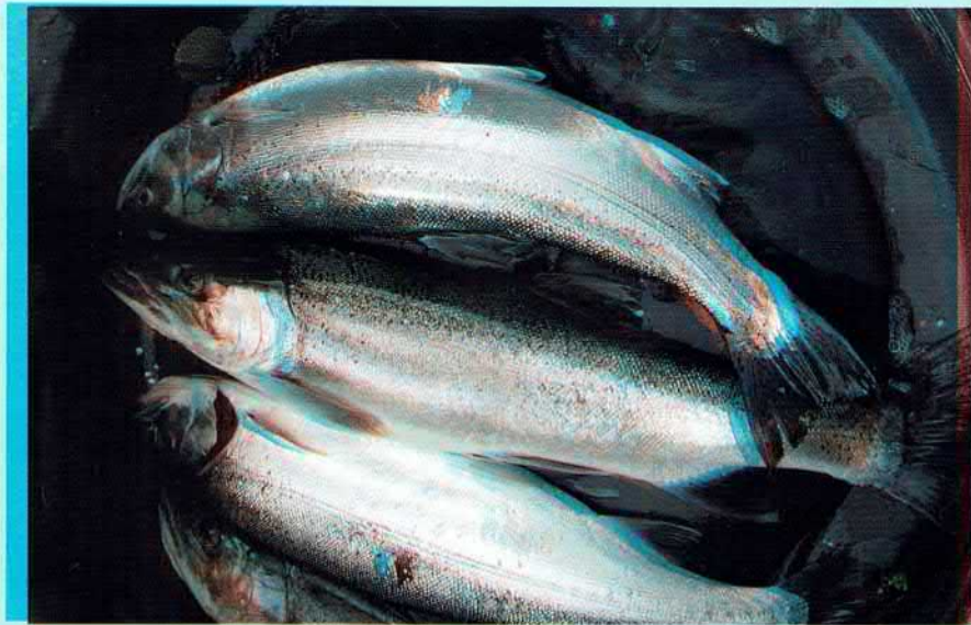
Taupo rainbow trout

Sounds a well-balance lifestyle, Bruce! - Ed.