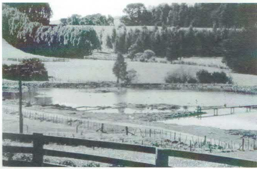
First view of ducks on Spring Lake.