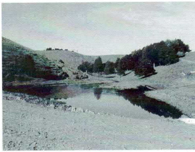
Left & above: Before – the Kahik' Wetland area in early March, and later – in May 2003.