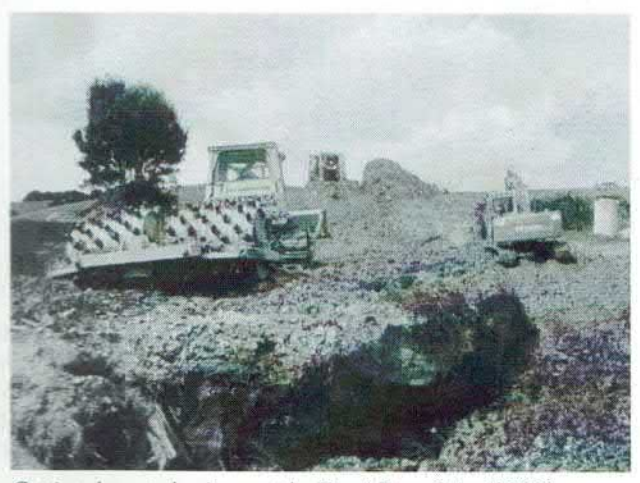
Getting down to business at the Kauri Dam, 2 April 2003.

At the head of this wetland, there is approximately 2ha of native bush, predominantly kahikatea. The exposed aerial roots of some of these trees could indicate that they became established in water. This wetland is narrower with good shallows, and no islands will be constructed. It is warm and sheltered. The construction of the dam is almost complete, but wet weather forced us to postpone all earthworks until next summer. The drop box system is the same as for the Kauri dam. The base pipe will be left open for the winter.