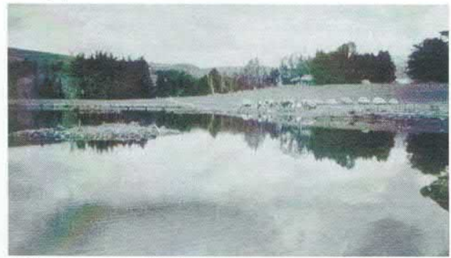
Reflections on a working bee.

of trees died or were damaged during July due to snowfalls and 10 consecutive frosts.