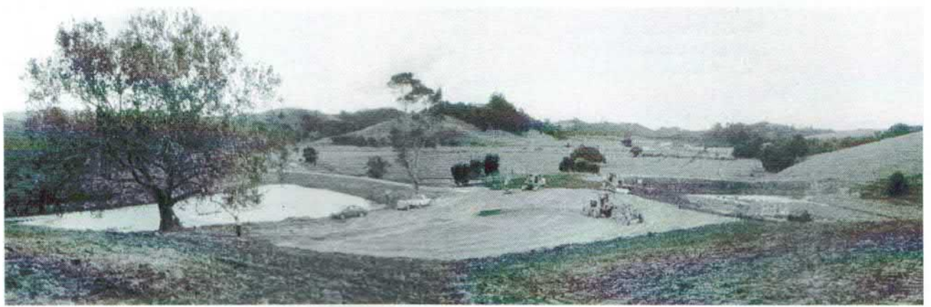
The day before the winter shutdown, 1 May 2003. Kauri Wetland Dam on left, Kahik' on right, planned Oak Wetland beyond.

'We take every available opportunity to make landowners, surveyors, real estate agents and councils aware of the value of natural wetlands and the potential of reinstated drained wetlands when considering subdivision and land use.'