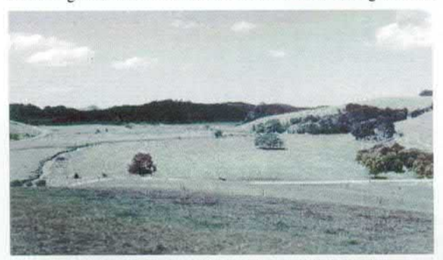
The area which will form the Oak Wetland, 4 March 2003.

Following discussions with Robert Webb from the Whangarei Bird