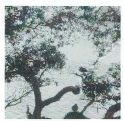
Pateke roosting in a pohutukawa, O'Shea property, Great Barrier Island.

26 Odin Place, Beach Haven Auckland 10, email:carpet.court@xtra.co.nz